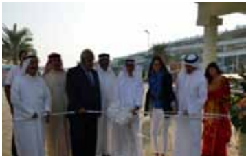
Photo Gallery: Diva Festival at The Lagoon on 18th-19th of November.

How can we improve our newsletter? I suggest dedicating one special page for advertisements for Amwaj's residents.