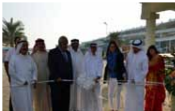
Photo Gallery: Diva Festival at The Lagoon on 18th-19th of November.

How can we improve our newsletter? I suggest dedicating one special page for advertisements for Amwaj's residents.