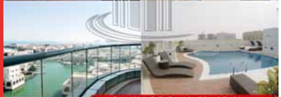
Brand New Fully Furnished 1 or 2 Bedrooms for Rent In Amwaj Islands with an Amazing View