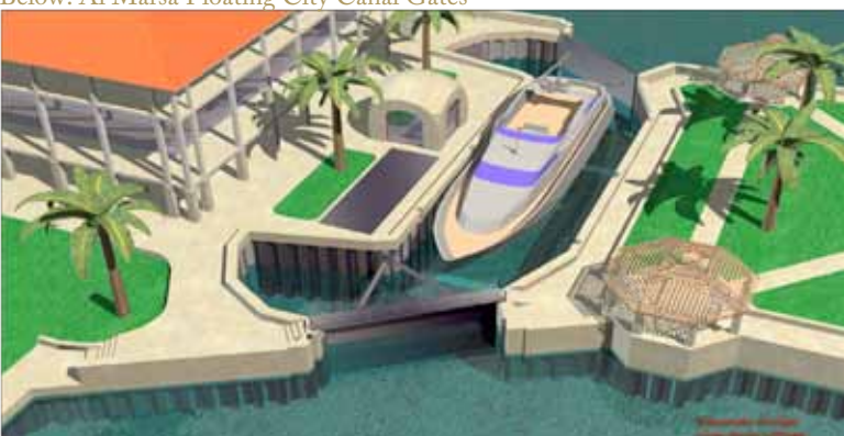
Below: Al Marsa Floating City Canal Gates

• The canal gates used in Al Marsa Floating City are there to facilitate the movement of the boats from/to the canal to/from the sea. The gates are placed into a 40 meter long, five meter deep basin, that will accommodate boats up to 60 feet long.