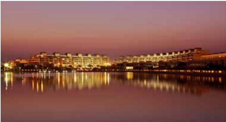
Photo of the Month!