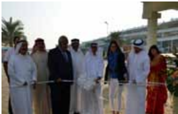
Photo Gallery: Diva Festival at The Lagoon on 18th-19th of November.

How can we improve our newsletter? I suggest dedicating one special page for advertisements for Amwaj's residents.